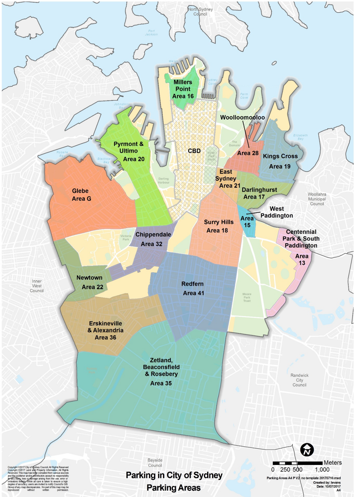
Figure 1. Parking areas